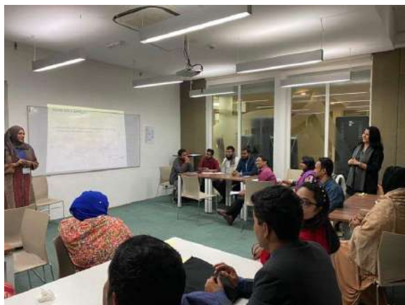
BELTA-BC Teacher Development Programme