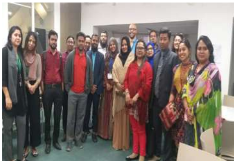
Participants with the trainers at BELTA-British Council Professional Development Session