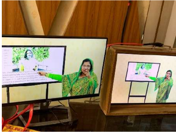
Picture: From the studio while recording a class

working together maintaining social distance.