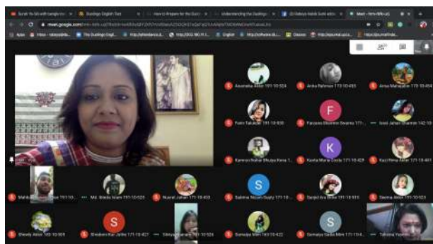
Picture: Boishakhai Adda Using Google Meet

For assessment based on carefully prepared questions requiring learner creativity and problem-solving skills, BLC quiz and assignment are used through which learners can be assessed anytime anywhere keeping in mind the internet connections and power failure — common to Bangladeshi education context. DIU is already working on the upgradation of BLC which will add more to the creditability and reliability of online classes and assessment through gamification and state of the art features of online pedagogy.