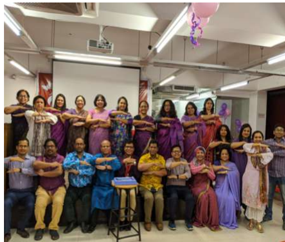
Picture: BELTA Leaders Giving Women's Day Theme Pose