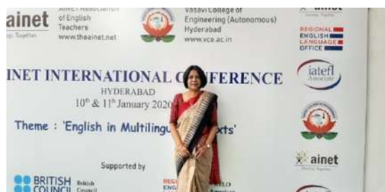
BELTA President @ 5 th AINET Int. Conference

Around 400 teachers from different states of India and other parts of the world attended in this two-day long, lively and well-organized conference. It offered participants the opportunity to attend two plenary sessions, 29 workshops, 135 paper presentations and 38 poster presentations on varied topics related to the field of English language teaching and learning. Alongside gaining new insights into ELT and professional development, the participants enjoyed networking, making new friends, sharing their views and knowing one another's culture.