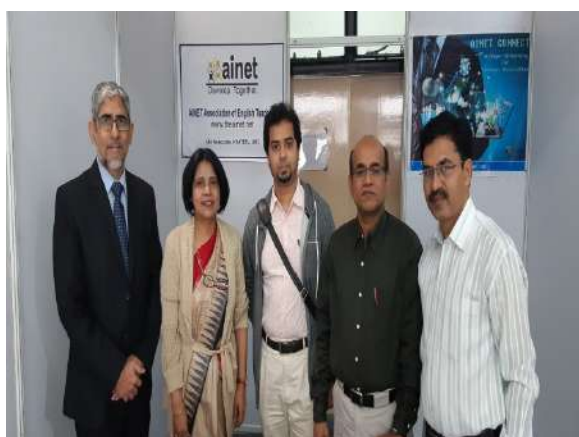
BELTA President @AINET Conference