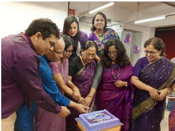
BELTA Leaders Cutting Cake @Intl' Women's Day Celebration