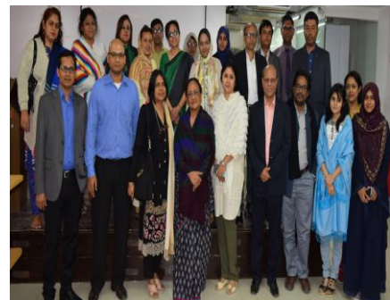
With the Participants