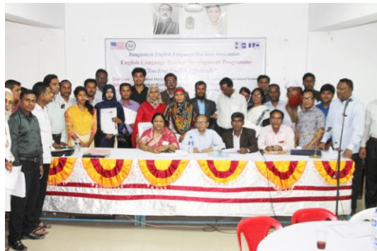
BELTA- Panchagar Chapter Opening Programme