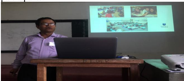
Chapter Coordinator Presenting at the Conference