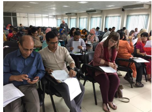
BELTA-THT event at South-East University, Dhaka