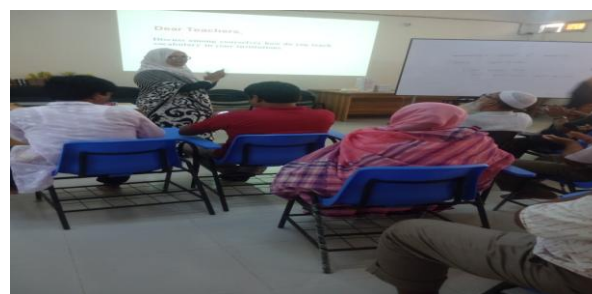
Pabna Chapter Coordinator during her workshop session

The participants were enthusiastic and responsive as they enjoyed the sessions.