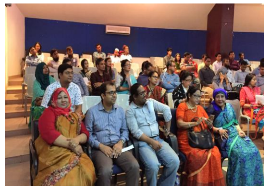
BELTA members at Annual General Meeting, 2018