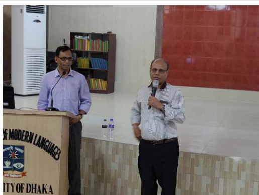
English language Seminar at IML Auditorium, Dhaka