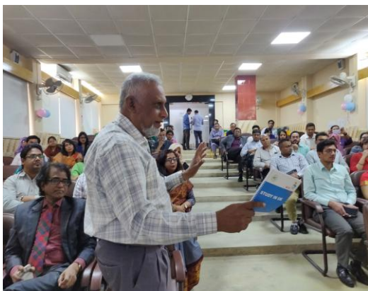
English language Seminar at IML Auditorium, Dhaka