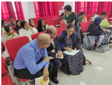
Facilitator Instructing the Task