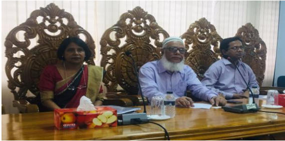
Keynote Speaker with the Chief Guest and Chapter Coordinator, Mymensingh