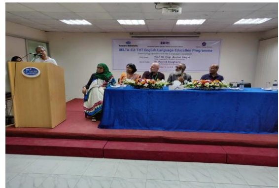
BELTA-THT event at Eastern University, Dhaka