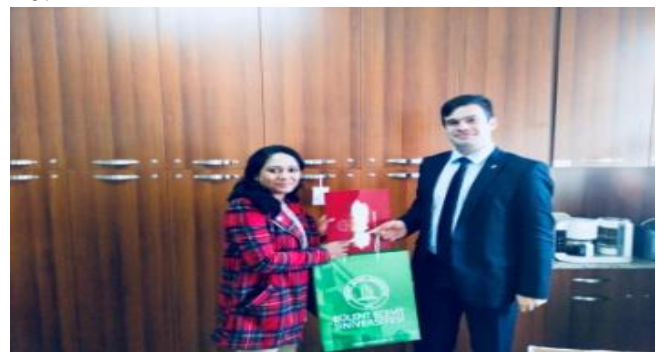
Receiving the Certificate and Gift from the Director, International Affairs, BEU

first week of December, 2018. Later, she also made a presentation about Bangladesh, DIU and its Department of English on December 10.