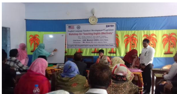
Participants Writing on Board during an Activity

Venue: Kobi Bonde Ali Mian High school, Atghoria , Pabna