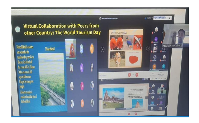
BELTA International Conference (Virtual)