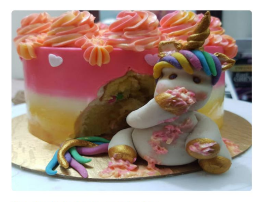
The Ponkhiraj Horse Visits My..

Bloom's revised taxonomy of cognitive skills. This approach enables learners to develop critical thinking skills while simultaneously building comprehension. New reading texts are being added regularly, as writers contribute these, and the quantity of materials is growing steadily.