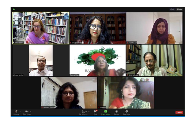
BELTA Webinar Series-8