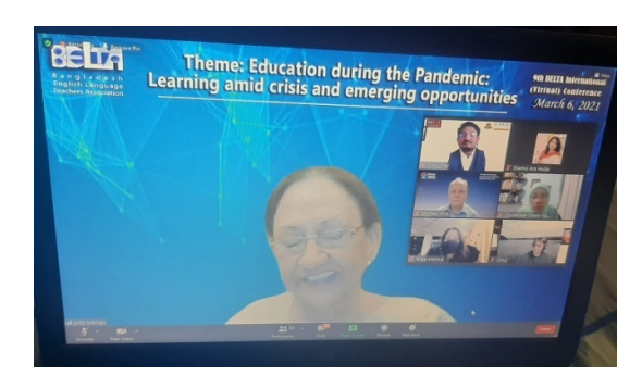
Closing remark from BELTA Advisor

In keeping with the Conference theme "Education during the Pandemic: Learning amid crisis and emerging opportunities", two panel discussions were organized. The first reflected on the current situation amidst the disruption caused to education in a number of Asian countries and how different contexts coped with the crises by adopting remote online learning. The second panel looked at the post-covid days ahead and deliberated on how to move forward in a changed global environment in order to provide effective and sustainable English language education for all.