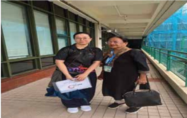
BELTA Advisor and IPP at 23 rd AsiaTEFL International Conference