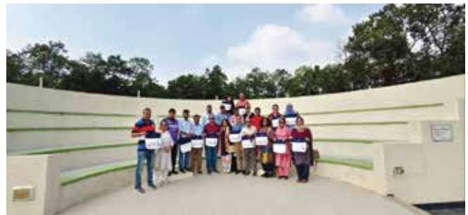
BELTA EC Meeting at UAP